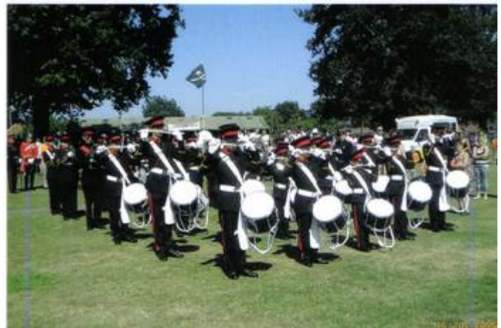
The band ready to march on (very smart indeed)