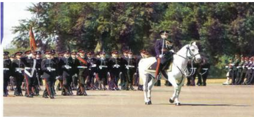
Officers and Cadets on parade

All entries to be back with me by the end of August. The first correct answer drawn from a hat will win a new pair of ShawX White Drum Sticks .