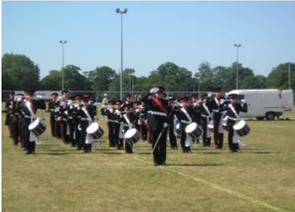
(The Salute to signify the end of the performance)

The one down side was that during our performance we went 15 seconds over time and therefore had three penalty points deducted. If this had not happened we would have been the out right winners of the novice class. I have to say that I have been proud of our band on many occasions, but Sunday was the ultimate for me. To think that eleven months after our first practice evening the band achieved this was truly incredible. Well done to every band member for their hard work and commitment. One final note, everyone now has the contest bug and we will be back next year to show how we have taken on board the judges comments and improved over this year.