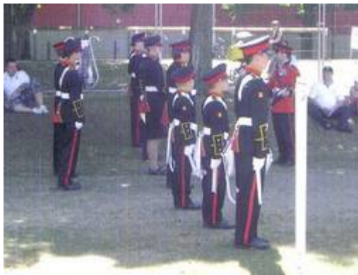
(Band members being inspected for turnout)

Sunday 16 th July saw the Sandhurst & District Corps of Drums enter their first ever band contest. The Rushmoor Youth Band Contest was held as part of the Aldershot Army Show. The day started with us all meeting at 10.00 a.m. We started getting ready for our performance which was to be at 11.10 a.m. thankfully, we were playing during the morning as it was an extremely hot day and at least we did not have the full heat which other bands experienced as the day went on. We marched down to the holding areas where nine of our band members were picked at random to be inspected for their turnout.