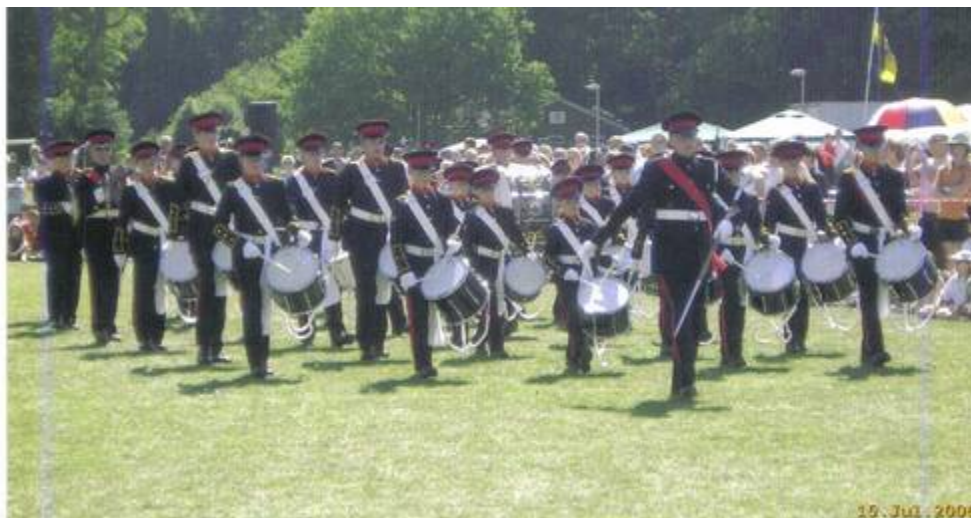
Here they come.....

As we marched off the audience gave another massive round of applause with many of them cheering. We managed to get away from the arena before two band members had to be pulled out due to the heat. However, after a well deserved drink of water and a cold face wipe they were OK. At the end of the event the money collected from the tombola's was counted and after floats taken out we made £230.00 which will go towards our general band fund. So again, another very successful day for all concerned.