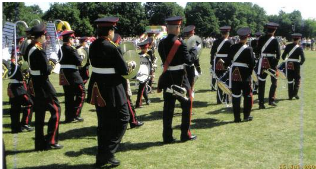
There they go...