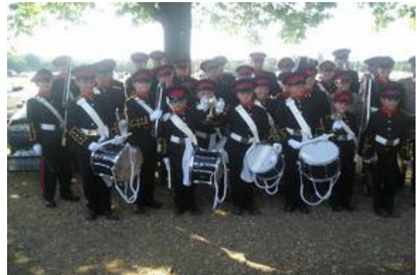
(Proud members holding cups that were won)

Once this was completed we marched round to the arena entrance and then marched in to the arena to get ready to perform. After saluting the judges to signify we were ready to start we opened with our bugle call and drummers call. Then stepped of to Farmers Boy followed by Jalalabad. Once halted, we played the Great Escape, World in Union and finished our performance with Those Magnificent Men in their Flying Machines. I have to say that we received a really good response from the audience which always helps to give the band members confidence. At 4.00 p.m. we again marched down to join the other bands for the final muster and awards giving. I was completely surprised and extremely proud when we were awarded a cup for best Wind (bugles) and best Mallets (Bell Lyre) we also shared the cup for second place.