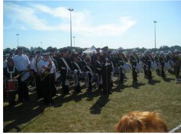
(Bands form up for Awards)