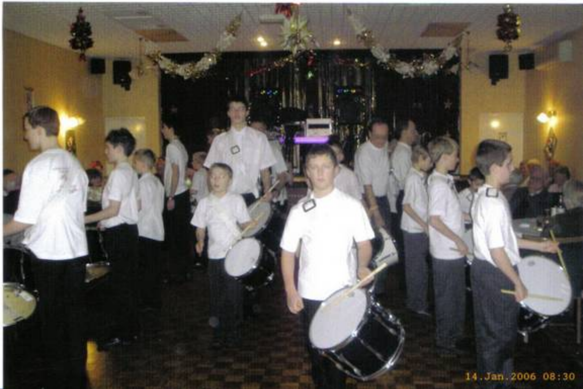
Presentation of the Co-operative Group Award – Fair Trade Evening December 1st 2005