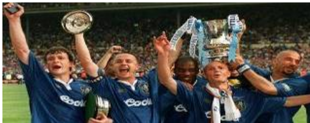
1997 FA Cup winners – Chelsea FC