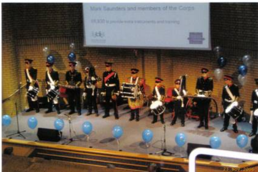
Members of the Corps of Drums at the Local Network Fund Awards ceremony, November 2006