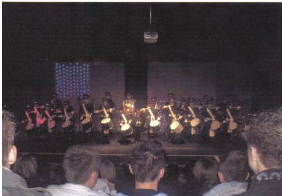
Sandhurst School Variety Show – 19th December 2006

Our last event in 2006 was the Sandhurst School Variety Show which was held on Tuesday 19 December. Each year the school puts on a variety show which sees a whole host of different acts. This was the first year they have ever had anything like us and I have to say that the response the band received was really great. From behind closed curtains the band played a bugle fanfare and then drummers call. I then stepped the band off to Sarie Marias and at the same time the curtains opened and the lights went on the band. The effect was really good. I have to say that this was the first event we have done where the girls in the audience were screaming. I felt like a pop star until someone pointed out that they were screaming at the boys in the band, oh well never mind I suppose I am a granddad now?