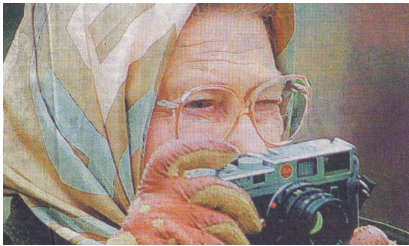
Even the Queen could not get a seat at the concert. We found her taking pictures through the window.

We expected a few mistakes to happen and they did although many people may not have noticed them. However this is good as we can learn from them and improve things for next time. However, 95% of what the band done was spot on and I really believe that the audience were more than impressed. So to summarise, everyone connected with the band were very pleased that the evening went well and everyone enjoyed the first big performance. Well done to the band.