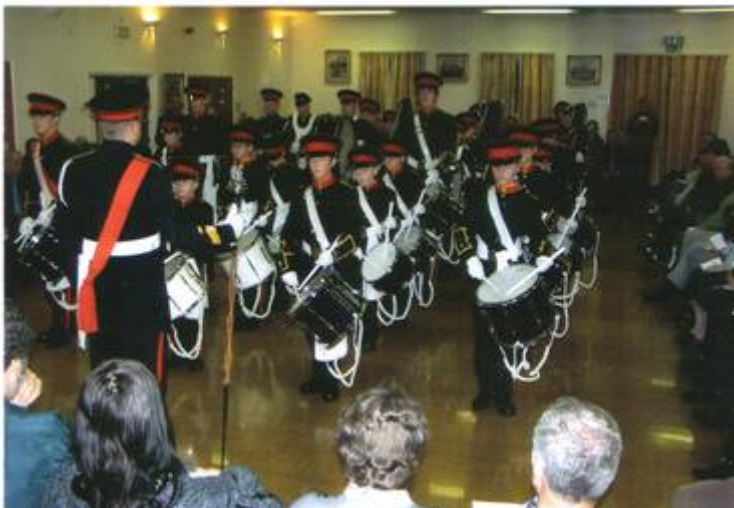
Full band at attention and ready to play

We have received many calls of congratulations for what the band achieved at the concert. When we first thought of putting this event on we had several reasons why we felt we wanted to do it.