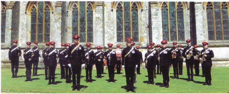
The Light Cavalry Band