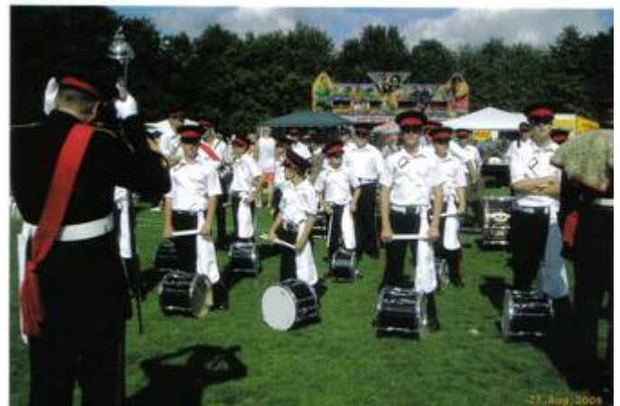
Band waiting to perform, Drum Major has some serious hat problems I think?

After the cancellation back in May due to bad weather, Sunday 28 th August saw the Sandhurst Donkey Derby take place. This time we had good weather and it was actually quite hot for most of the day. The Corps of Drums performed in the main arena at 3 p.m. and received yet another good response from the local audience. Our fund raising team worked hard during the day and after a final count up we made £105.00 profit which was not bad for a few hours. We also had some interest from new potential members, many of which had not seen us before. Well done to everyone who took part on the day and we have already been invited back for next years Donkey Derby.