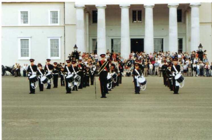
The Sandhurst & District Corps of Drums