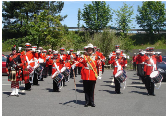
The Medina Marching Band

It may only be a few miles across the water but it is really good to have an association with the Medina marching band from the Isle of Wight. As you know we met with the Medina marching band earlier in the year to hold drum, bell lyre and bugle workshops. This proved to be a very successful and enjoyable day for everyone and I really hope we can arrange further trips to the Isle of Wight to meet up with them. On a personal note, I think there is a great deal to be learned from other bands and it's a shame that many youth bands seem not to want to work with other youth bands. I am really pleased that we have a good relationship with the Medina marching band and hope that we get an opportunity in the future to invite them over to us? I would also like to congratulate them for what seems to have been another successful year. You can read and see more on the Medina Marching Band by visiting their web site which is www.mmband.org.uk