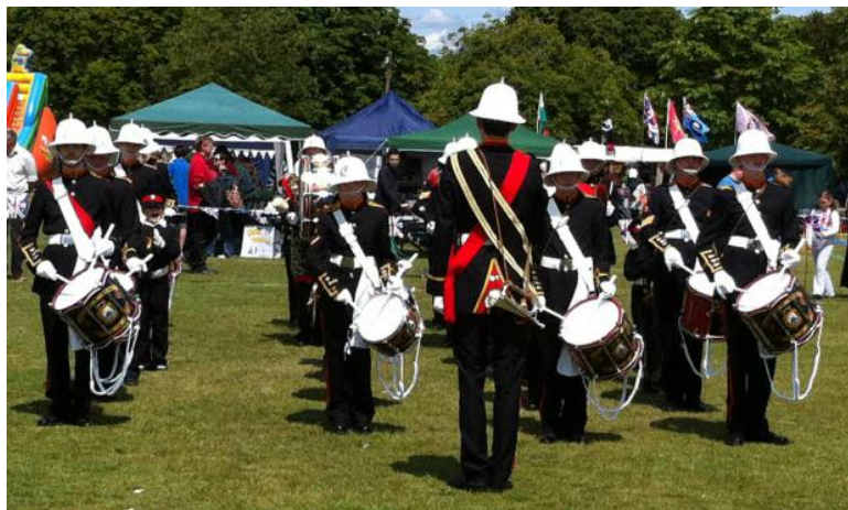
Band on Parade at the Sherfield on Loddon fete

The summer of 2011 has been quite a busy time for the band and also the Training Band who joined the main Band for the majority of the parades this summer. Over all we have performed at nine parades since the end of May starting with the Sandhurst Donkey Derby on the 30th May. In June we performed at Sherfield on Loddon fete, St Barnabas Church fete and then we finished our June parades with our biggest one of the year at the Royal Military Academy Sandhurst Heritage day which was well received by the audience and band members.